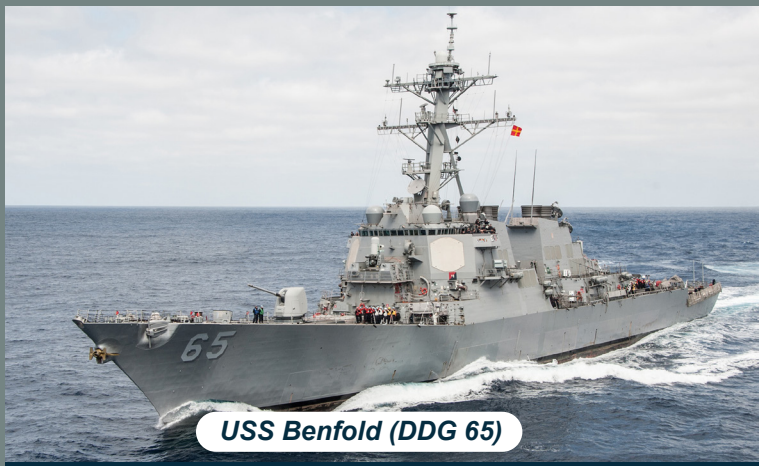
USS Benfold (DDG 65)