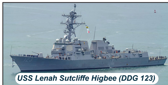
USS Lenah Sutcliffe Higbee (DDG 123)