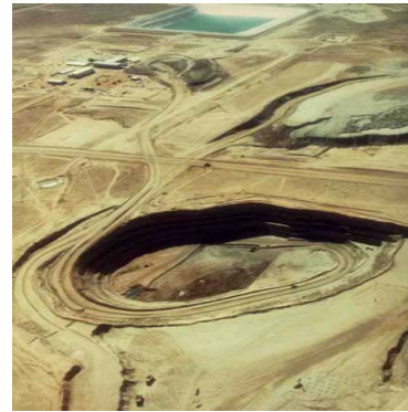
Sweetwater Uranium Mine in Wyoming