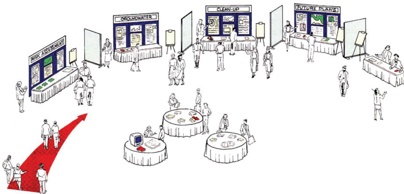
Figure 1. Typical Information Session Layout

sion or selecting your 'subject matter experts' to man your displays. There is much to be considered and understood about message development, messenger selection and preparation before effectively providing information to the public or other concerned audiences. Please contact NMCFHPC for more assistance or more information.