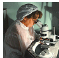
Laboratory Animal Studies