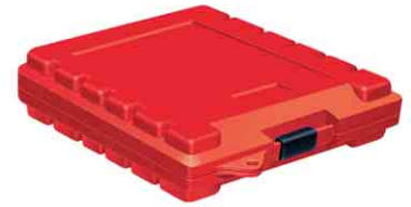
Rigid Plastic Container

MARKINGS: Patient specimens for which there is minimal likelihood that pathogens are present are marked by the shipper "Exempt human specimen" or "Exempt animal specimen" as appropriate to comply with current IATA regulations.