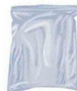
Sealed Plastic Bag