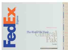
Large Clinical Pak (Front View)

FedEx provides a plastic FedEx Clinical Pak for clinical samples, Biological Substance Category B (UN3373) and environmental test samples with outer packaging sizes under 18cm x 10cm x 5cm (7" x 4" x 2"). The small clinical pak (inventory No. 150948) measures 31cm x 24cm (12 1/4" x 9 1/2") and is suitable for shipping single and smaller-sized test specimens. The large clinical pak (inventory No. 135629) measures 41cm x 33cm (16" x 12 7/8") and is more appropriate for multiple and larger specimen shipments. Any individual specimen packages placed in the FedEx Clinical Pak must meet the four basic packaging requirements (watertight primary receptacle, watertight secondary receptacle, absorbent material and sturdy outer packaging).