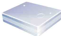
Sealed Styrofoam® Container (1-inch-thick minimum)

For Biological Substance Category B (UN 3373), enclose an itemized list of contents between the secondary packaging and the outer packaging. For liquids, the secondary packaging must be leakproof; for solids, the secondary packaging must be siftproof. These illustrations below are not intended to represent secondary containers for Biological Substance Category B (UN 3373). Secondary containers for Biological Substance Category B (UN 3373) must be certified by the manufacturer prior to use.