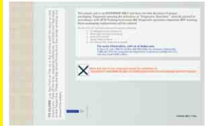
Small Clinical Pak (Back View)

If you are using the FedEx Clinical Pak to ship Biological Substance Category B (UN3373), you must check the applicable box on the back of the FedEx Clinical Pak.