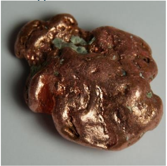
Natural Copper Nugget, 44 grams.

Copper is a naturally occurring metal found in rock, soil, water, and sediment. Pure copper is red-orange but becomes blue-green when exposed to air and water. For centuries, humans have used it to produce copper alloys including brass and bronze. Today, copper is widely used in the production of many items including pennies, electrical wiring, and plumbing materials such as household water pipes.