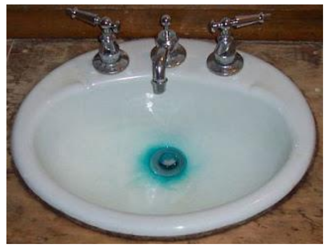
Blue-green staining caused by copper corrosion.

water in its drinking water distribution system less corrosive. The copper action level of 1.3 mg/L established by the LCR is also the maximum contaminant level goal (MCLG) for copper. A MCLG is the level of a contaminant in drinking water below which there is no known or expected health risk. MCLGs allow for a margin of safety and are non-enforceable public health goals.